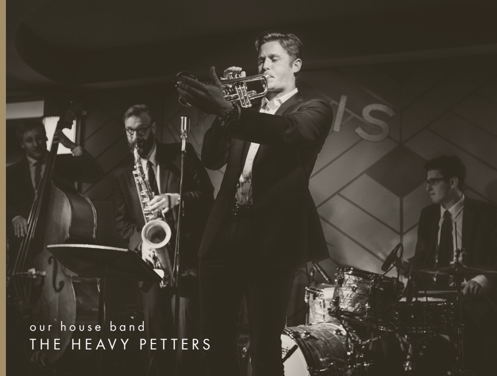
our house band THE HEAVY PETTERS